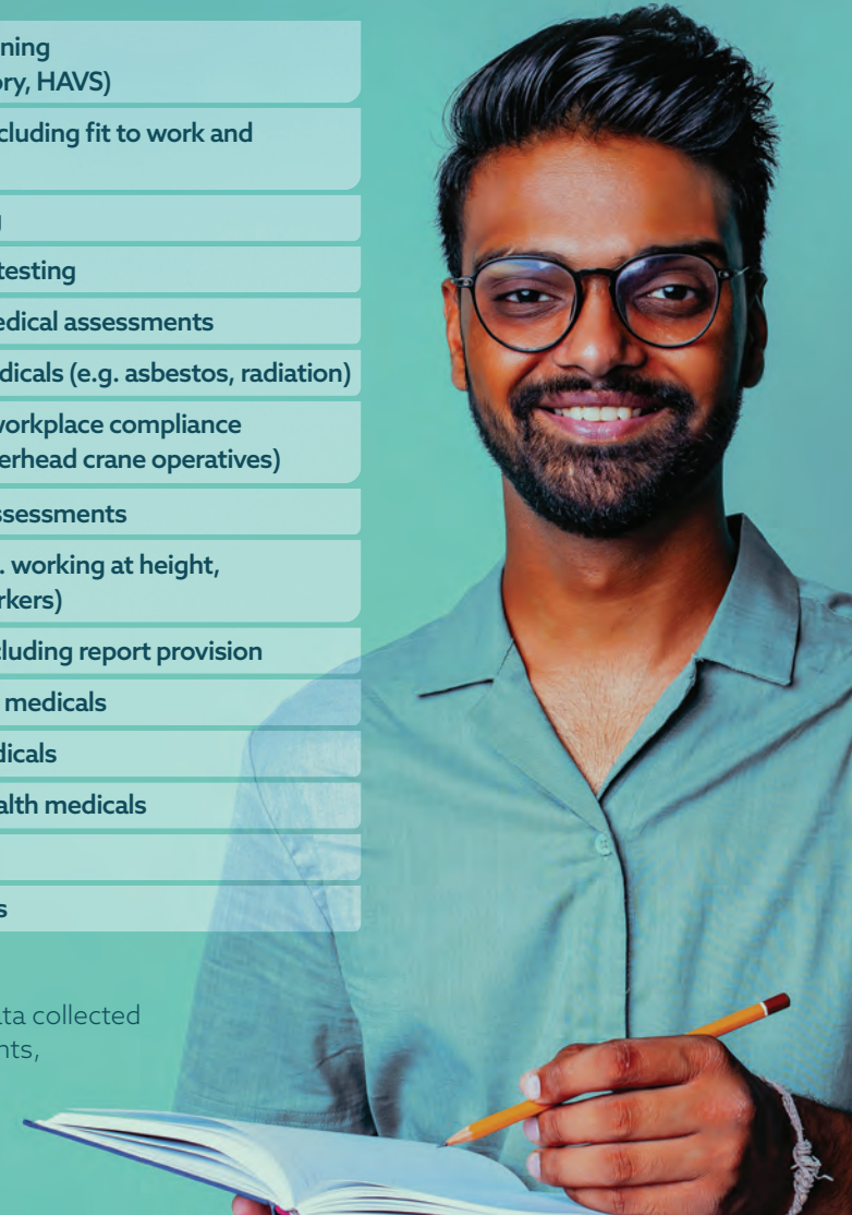
Executive and Lifestyle Medical Assessments

We also offer confidential maintenance of clinical data collected during medical assessments, referrals and reviews.