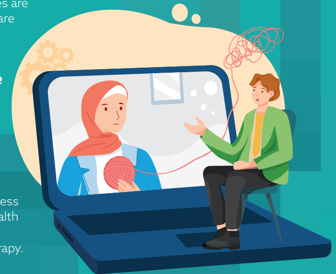
Executive and Lifestyle Medical Assessments