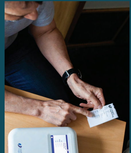
Rapid confirmation (top) and Results on the spot (above)

Spotting a potential problem before it happens could save you from future personnel issues.