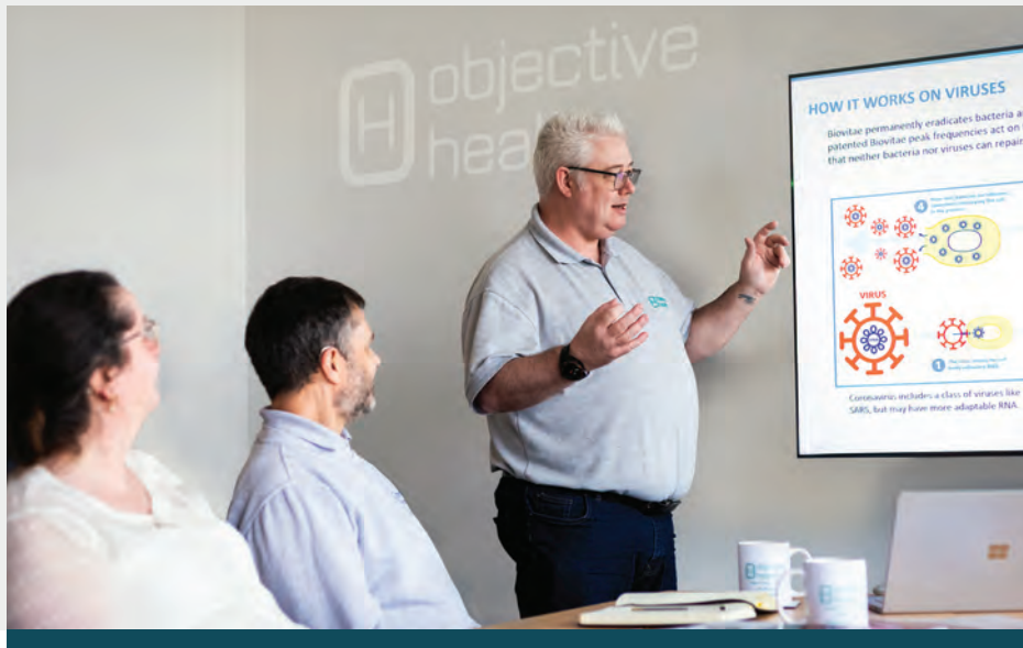
Training - How Biovitae works on viruses. (above)

The courses are delivered in a professional yet relaxed style by our team of highly experienced in-house trainers. Student interaction is encouraged and feedback at the end of each course is sought, ensuring a continual quality standard.