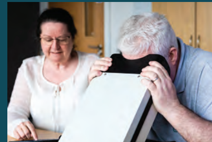
Visual Acuity - Eye Test (above) and Absence Management (top right)