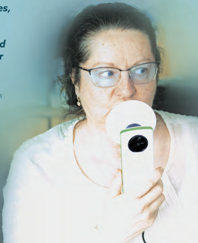
Spirometry - Lung Function Test (above)

*NB: this is not an exhaustive list; there may be other specific hazards in the workplace.