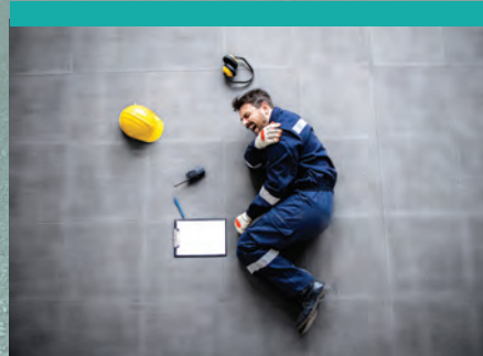
Identifying employees at risk.