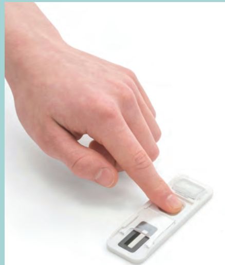
Substance Abuse Programmes