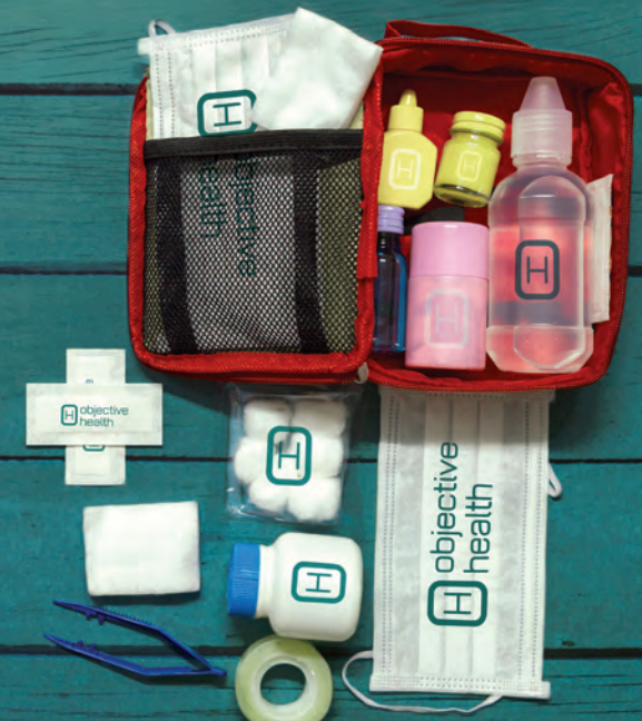
Rapid confirmation (top) and Results on the spot (above)